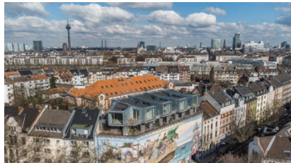
Picture heading: Bilker Bunker Drone view